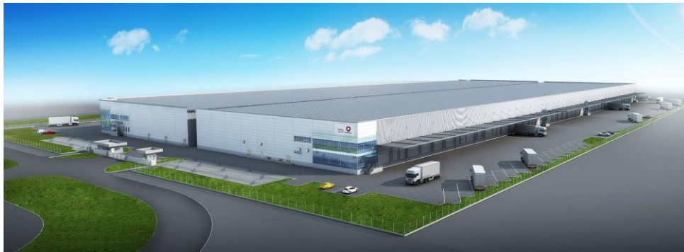
DMLP Phase I–1 and 2

The site work has been commencing on DMLP Phase I–2, a large-scale multi-tenant logistics facility, in Bekasi, West Java, Indonesia since October 2, 2017.