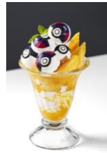
The Master Ball Parfait ¥1,718

Chef's recommendation. Butter chicken, Indian green curry and Thai red curry, Served with Pikachu colored turmeric rice.