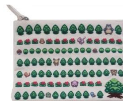
hug 3 Pokémon Pouch ¥8,208

Created in collaboration with fashion label hug 3 . Can you see the Pokémon hiding in between the trees and flowers?