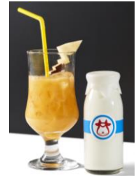
Fresh Fruit au Lait with Moomoo Milk ¥962

A special parfait served with generous amount of mango and vanilla ice cream.