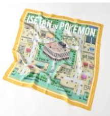
ISETAN IN POKÉMON Scarf ¥21,600

For Pokémon trainers who are not only strong but also stylish!