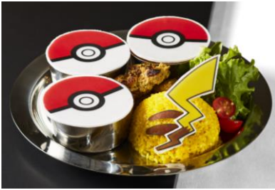
Memories of Encounter, Three Secret Curries ¥2,474

You can enjoy taking pictures of yourself as the boss of Team ISE-DAN at the Photo Spot.