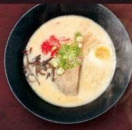
45. Tonkotsu Ramen