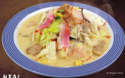
10. Regular Bowl