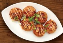
127. Crispy Takoyaki