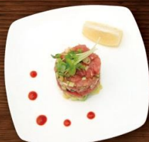
138. Tuna Tataki