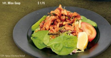
123. Spicy Chicken Salad