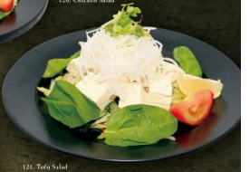
121. Tofu Salad