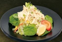
120. Chicken Salad