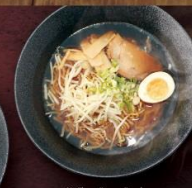
40. Shoyu Ramen Regular